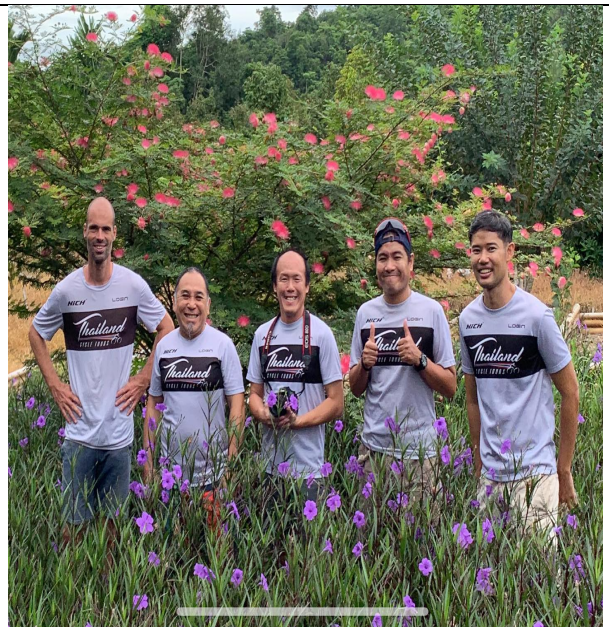
Guides Thailand Cycle Tours