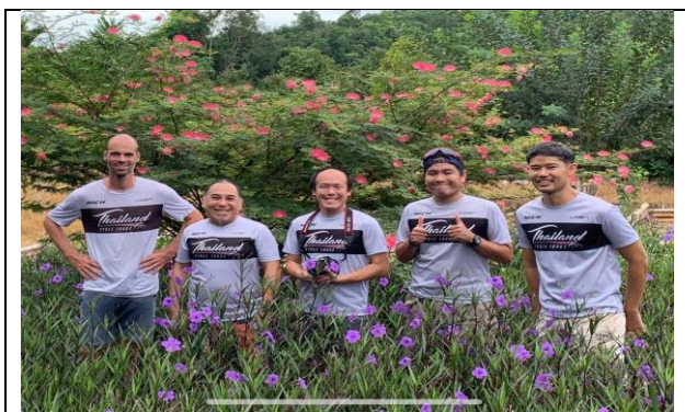
Guides Thailand Cycle Tours