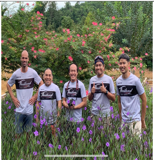
Guides Thailand Cycle Tours